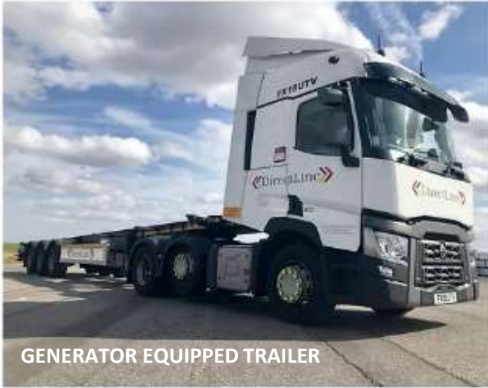
GENERATOR EQUIPPED TRAILER