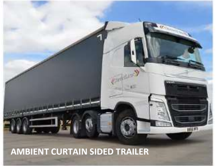
AMBIENT CURTAIN SIDED TRAILER