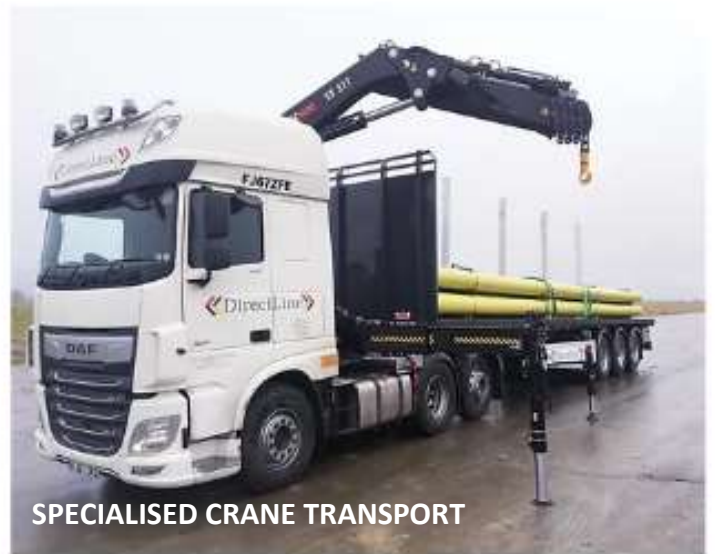
SPECIALISED CRANE TRANSPORT